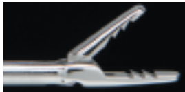
Combination Tissue/Suture Grasper