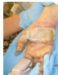
Full-thickness burn to right hand