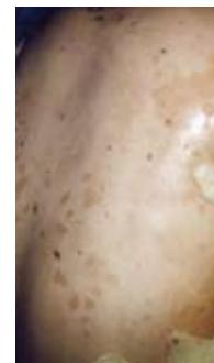
Figure 4. Patient's upper back at presentation.