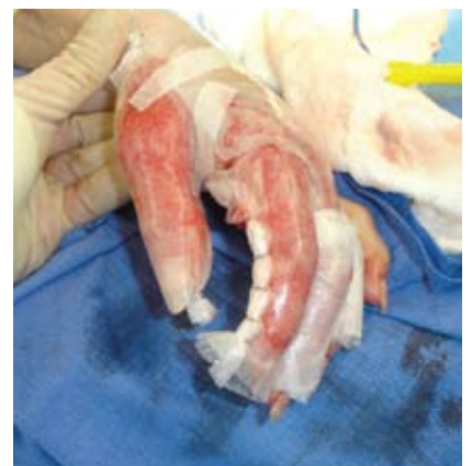
Patient's hand after VERSAJET with BIOBRANE ®

When seen in clinic one week post-operatively, the wound was healing well with almost complete re-epithelialization and no signs of infection. 2 weeks post-op the BIOBRANE ® was completely removed, revealing complete wound closure. There was minimal scarring and no discernible loss of hand function.