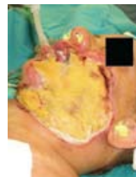
After debridement with VERSAJET, before application of ACTICOAT