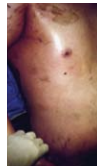
Figure 2. Patient's chest at presentation.