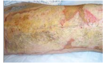
Xenografting followed by re-application of ACTICOAT

With the VERSAJET System, tissue excision is precise, avoiding damage to healthy tissue or vasculature. Also, the design of the handpiece allows access for debridement without the need to enlarge the wound, reducing postoperative morbidity and promoting wound healing.