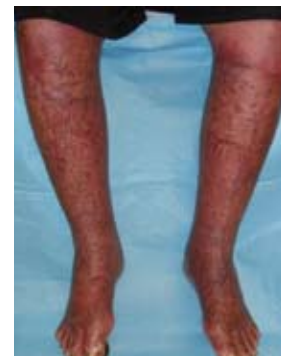
Figure 9. Patient's legs 6 weeks post-op after circumferential STSG.