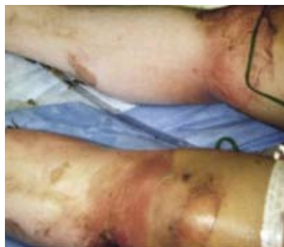
Figure 5. Patient's legs at presentation.