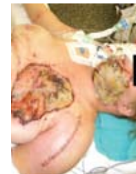
Prior to use of VERSAJET