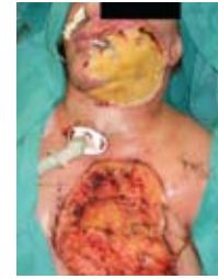
After VERSAJET application

With the VERSAJET System, tissue excision is precise, avoiding damage to healthy tissue or vasculature. Also, the design of the handpiece allows access for debridement without the need to enlarge the wound, reducing postoperative morbidity and promoting wound healing.