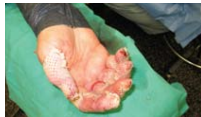
Xenografting followed by re-application of ACTICOAT