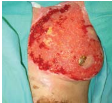
VERSAJET treatment and ACTICOAT application