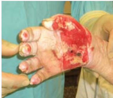
After applications of VERSAJET, and ACTICOAT and Negative Pressure Wound Therapy