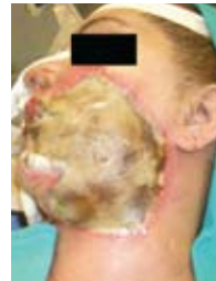
Full-thickness burn to face/neck

On hospital day #26 another application of VERSAJET was utilized for sharp debridement of a wound that continued to declare itself. VERSAJET was seen again to be the most discerning methodology for debridement. Like before, the only clearly necrotic tissue was excised. All attempts were made to salvage as much tissue as possible for future reconstruction.