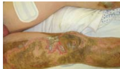
Application of ACTICOAT to leg burn prior to Xenografting