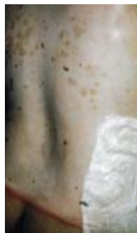
Figure 3. Patient's lower back at presentation.