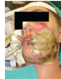
Full-thickness burn to face/neck