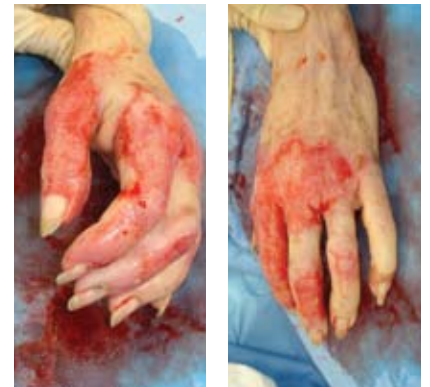
Patient's hand after VERSAJET

Surgery was successfully performed using IV sedation. Excellent debridement of the burn eschar was achieved with VERSAJET on a power level setting of 3. BIOBRANE ® and ACTICOAT were then applied.