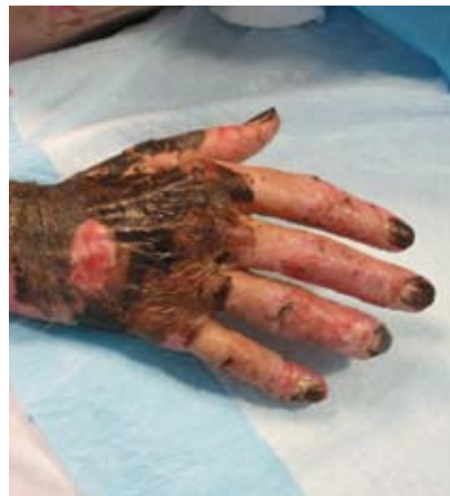
Long term follow-up: split-thickness autograft