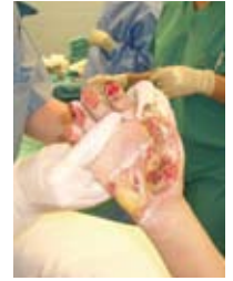
After VERSAJET treatment before application of ACTICOAT and topical negative pressure