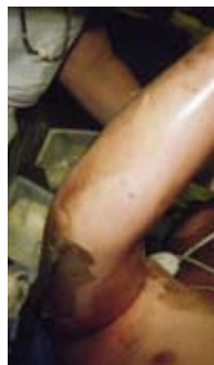
Figure 1. Patient's arm at presentation.