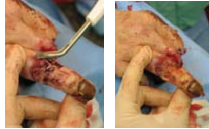
Sweeping motion of the VERSAJET (Power setting: 5)

VERSAJET allowed for excision and evacuation of damaged tissue/contaminants while simultaneously irrigating the wound. Surgical debridement was accomplished in a single step. Further, the device utilized a relatively small amount of irrigant which immediately was evacuated, minimizing saturation of the operative field and reducing the risk of splashing and aerosolisation. VERSAJET was seen to be the most discerning methodology for debridement, allowing only clearly necrotic tissue to be excised. This method made it possible to salvage as much tissue as possible for future reconstruction.