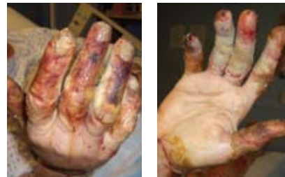
Xenografting of right hand with serial applications of ACTICOAT ◇